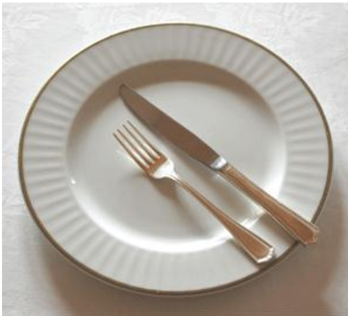
American style - I'm finished position